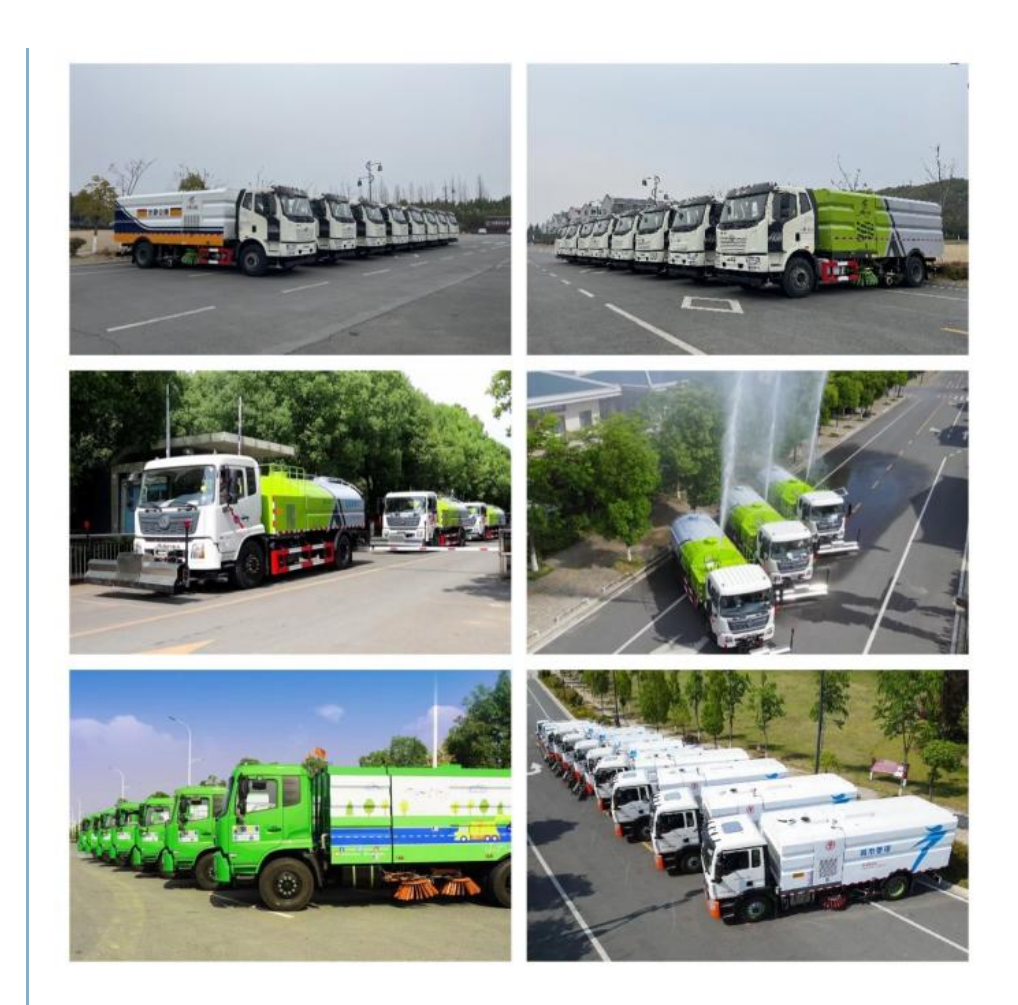
High pressure road sweeper truck loading