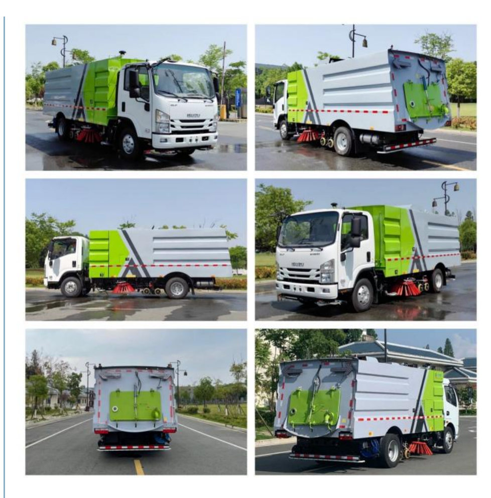
High pressure road sweeper truck function display