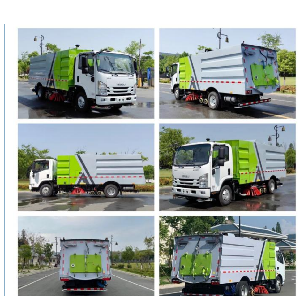
High pressure road sweeper truck function display