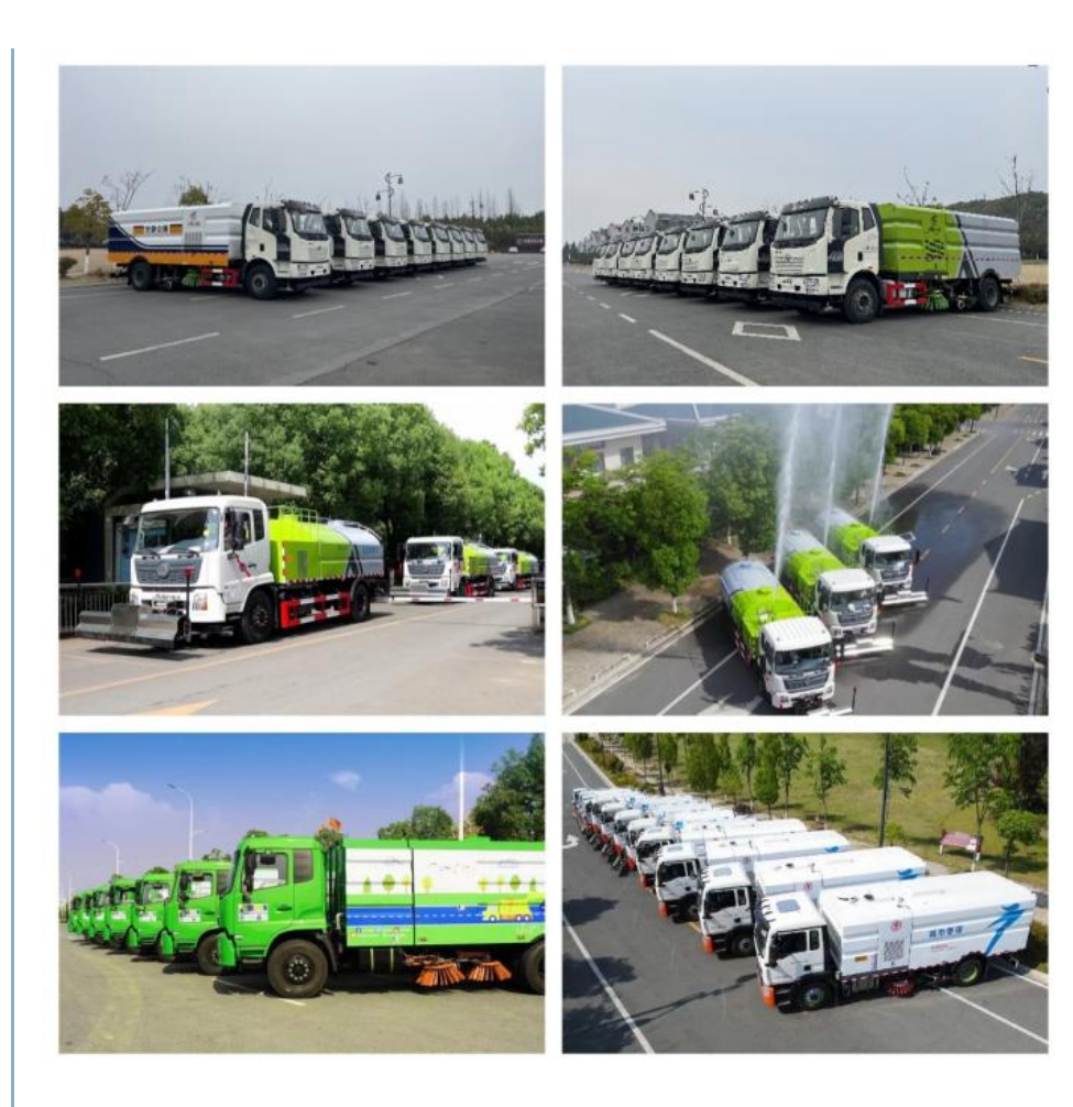
High pressure road sweeper truck loading