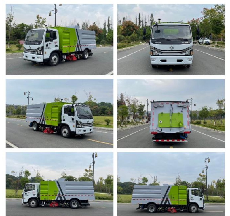
High pressure road sweeper truck function display