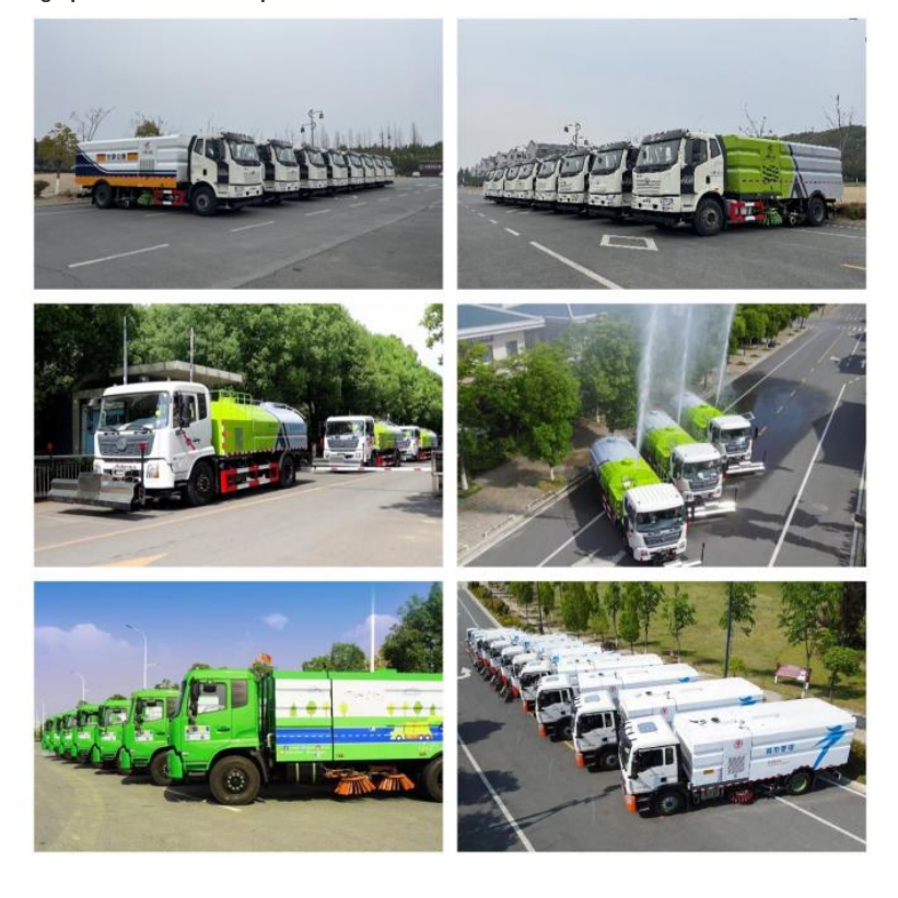
High pressure road sweeper truck loading