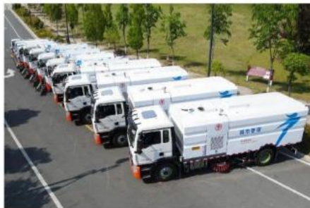
High pressure road sweeper truck loading