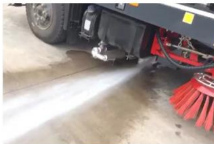
High pressure road sweeper truck bulk order