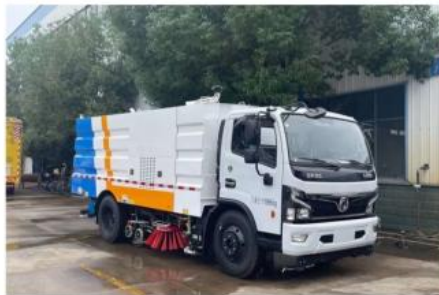
High pressure road sweeper truck function display