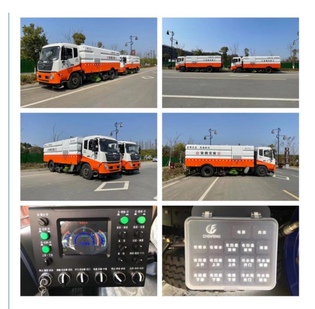
High pressure road sweeper truck function display