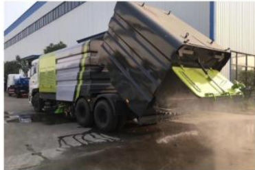
High pressure road sweeper truck function display