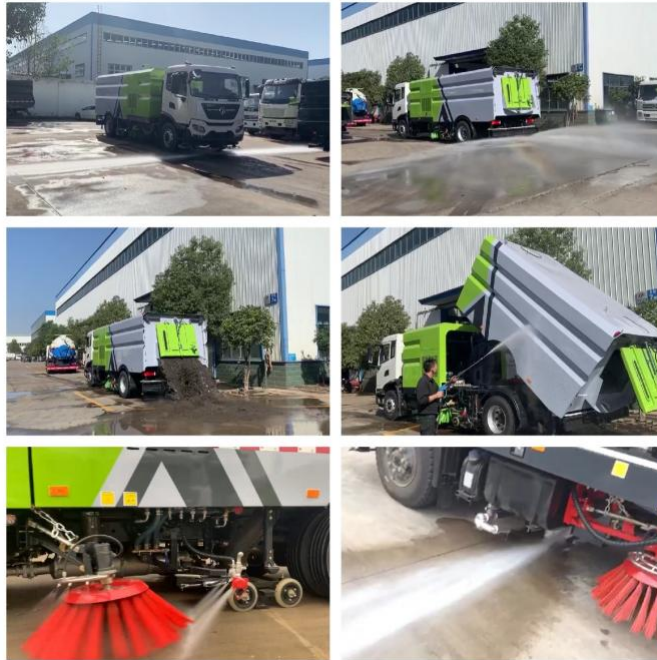
High pressure road sweeper truck bulk order