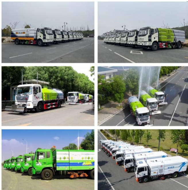
High pressure road sweeper truck loading