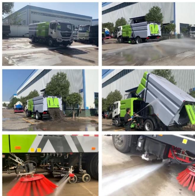
High pressure road sweeper truck bulk order