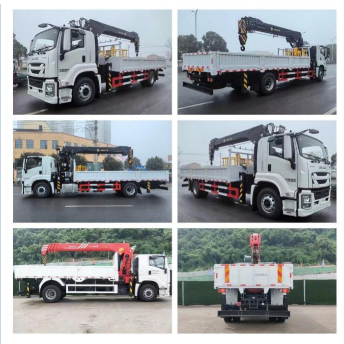
Crane Truck Working Stock