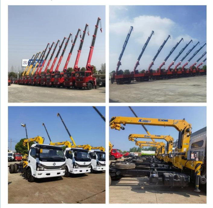
Crane Truck Working Working