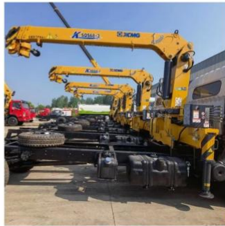
Crane Truck Working Working