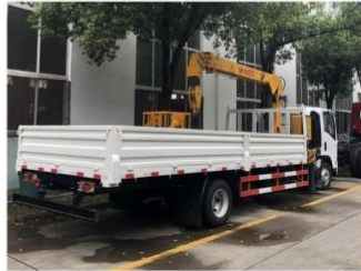
Crane Truck Working Stock