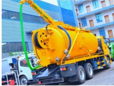
Combine Sewage Clean and Suction Truck Stock