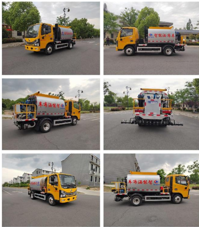
Asphalt truck store site