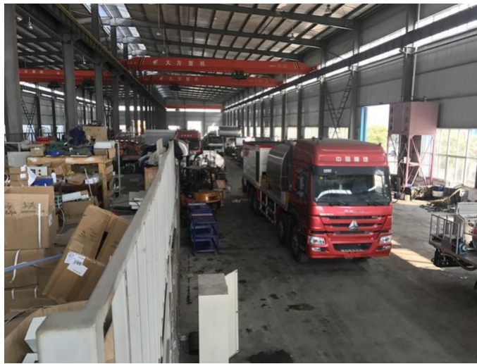
Asphalt truck working at site