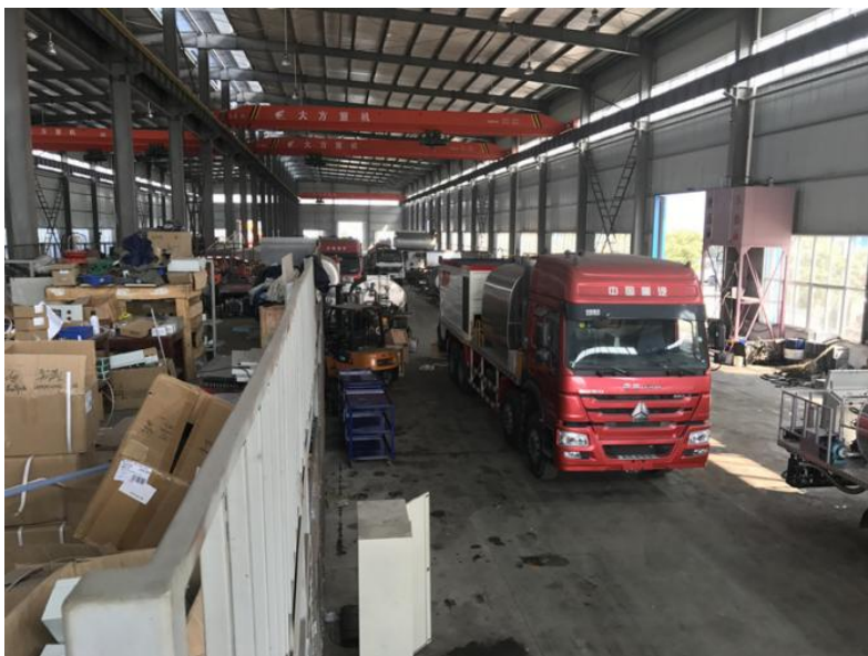
Asphalt truck working at site