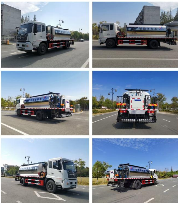
Asphalt truck store site