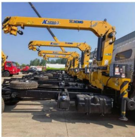
Crane Truck Working Working