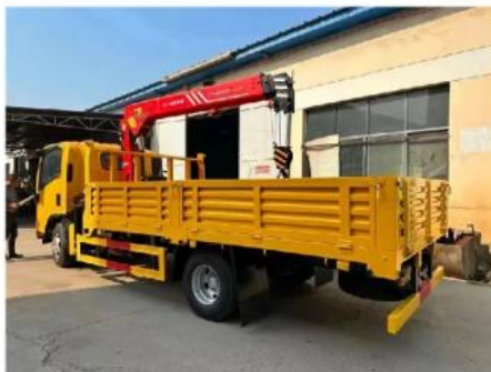
Crane Truck Working Stock