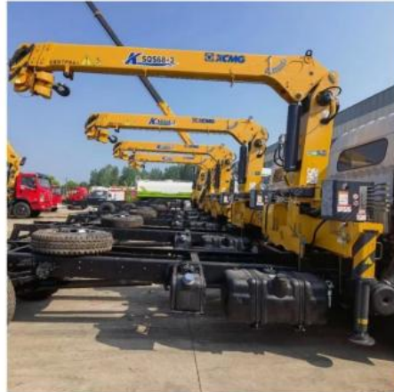
Crane Truck Working Working