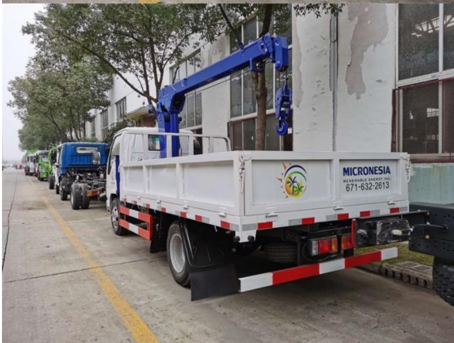
Crane Truck Working Stock