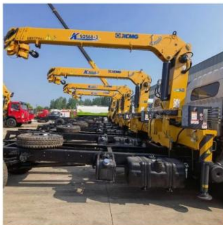
Crane Truck Working Working