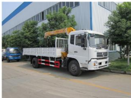
Crane Truck Working Stock