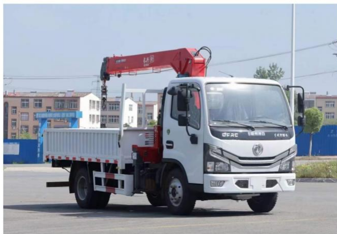
Crane Truck Working Stock