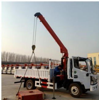
Crane Truck Working Working