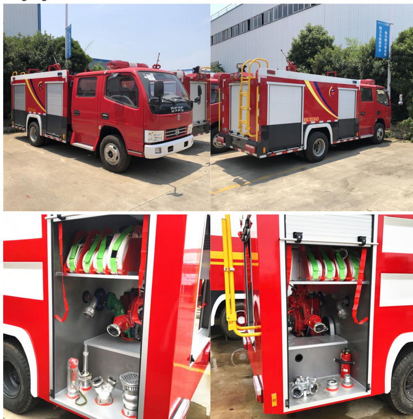
Dongfeng Fire Rescue Truck Picture