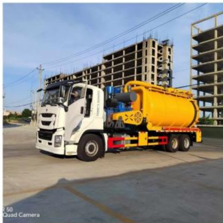
ISUZU High Pressure Sewage Clean and Suction Truck Picture

Clean water tank 10 cbm, Rust proof tank body, 6mm thick, with measuring pipes on the left and right sides for cleaning and preventing water ingress. Pinfu 330 flow high-pressure pump, sewage tank 10 cbm, 8mm thick, 4 partitions, partition sealing reinforcement, SK-12 water ring pump, pneumatic sewage discharge outlet at the tail 220, sewage discharge outlet at the tail 100, one sewage pipe on the left and right sides of the tank, guardrail on the top of the tank, hydraulic suspension rod installation of 10 meter sewage suction pipe, with remote control, platform below the tank, and built-in top, The back cover can be opened, with 4 locks, and the tail coil is enlarged. Accessories: 200 meter high-pressure pipe, 10 combination nozzles.