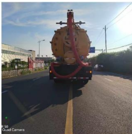
Combine Sewage Clean and Suction Truck Stock