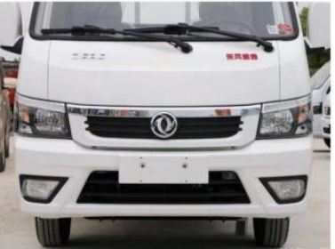
Cargo Truck Working Stock