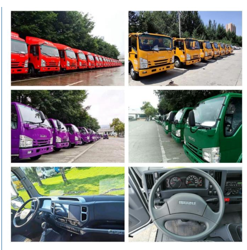
Cargo Truck with Crane Working