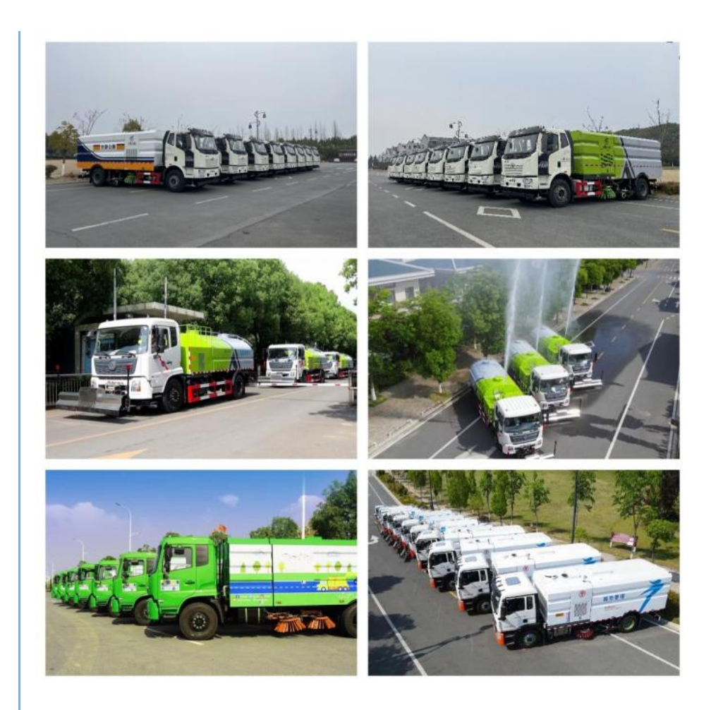
High pressure road sweeper truck loading