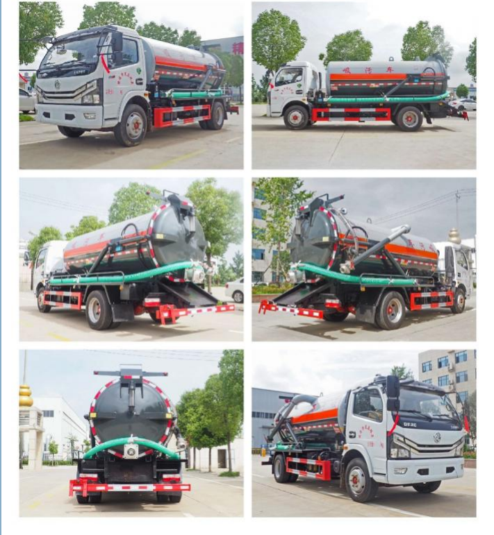
Combine Sewage Clean and Suction Truck Stock