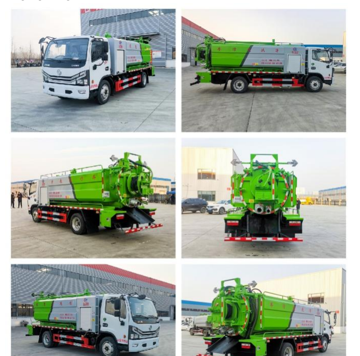
Combine Sewage Clean and Suction Truck Stock