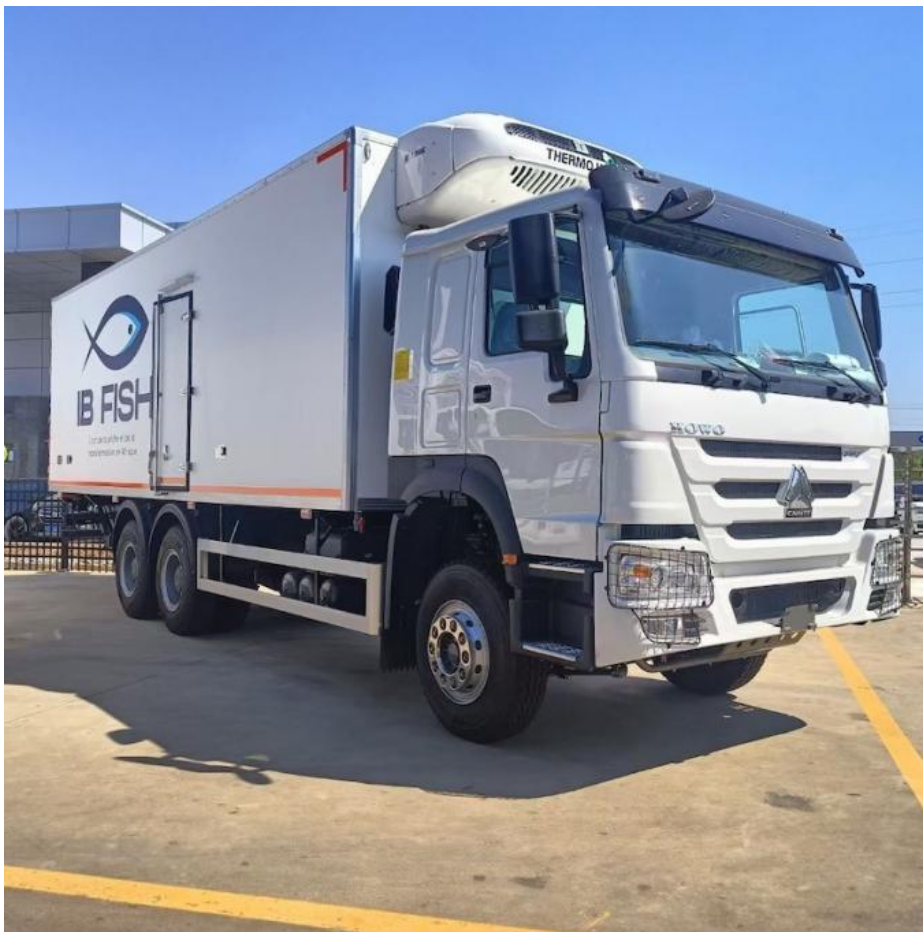
Refrigerator Van Truck Workshop