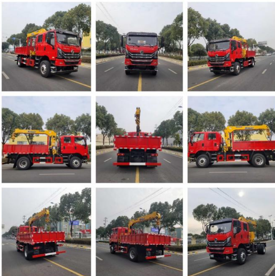
Crane Truck Working Stock