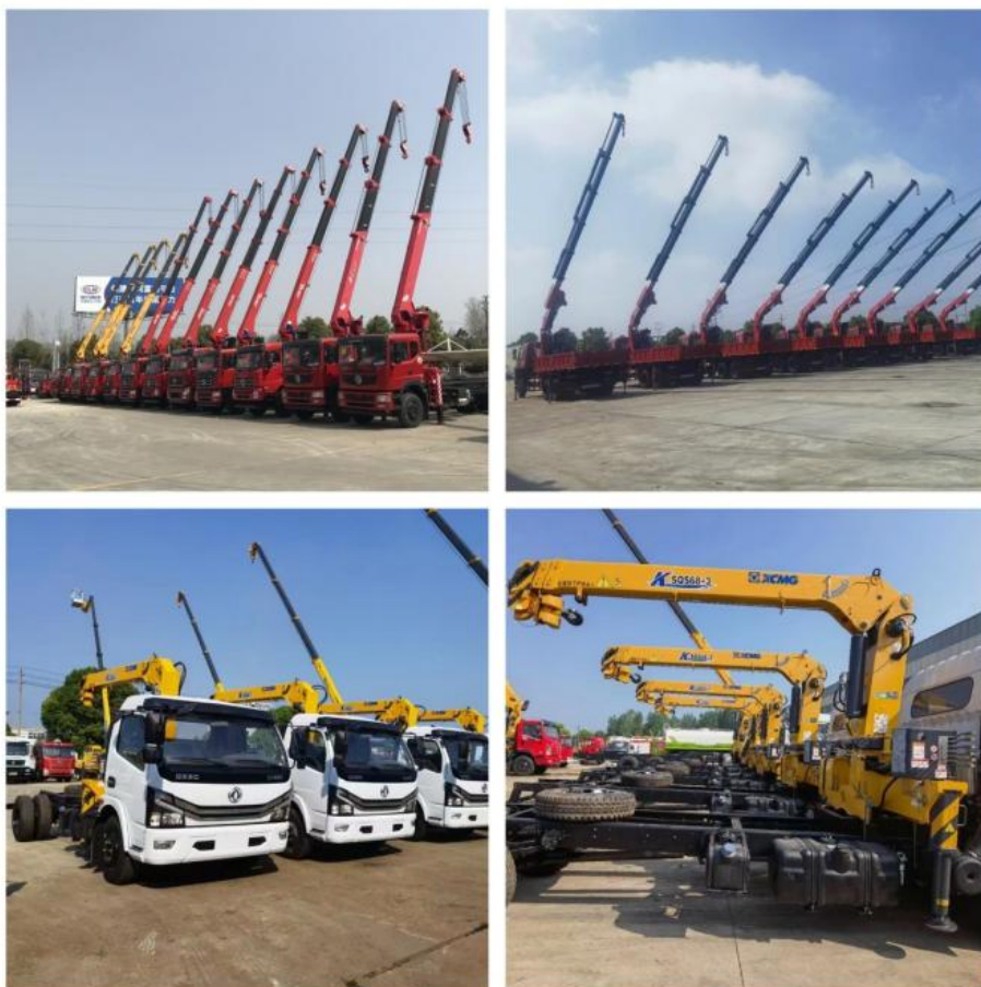
Crane Truck Working Working